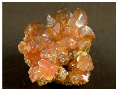
Orpiment (As S ) (N/A)