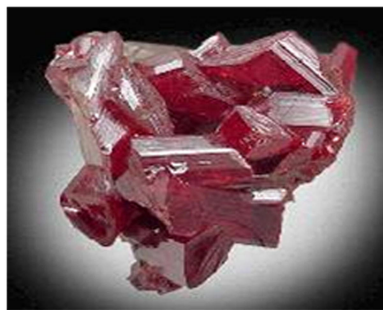
Realgar (As S ) (LD 3.2 g/kg)