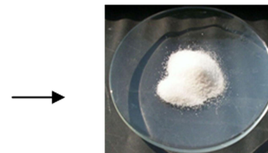
\text{O}=\text{As}-\text{O}-\text{As}=\text{O} Arsenic Trioxide (As O ) (32-39 mg/kg)