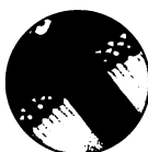
LIGAND-GATED ION CHANNELS