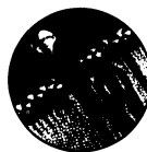
G PROTEIN-LINKED RECEPTORS

Call us for an evaluation of your cells and effector agents or for a detailed list of scientific references.